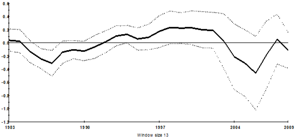
Fig 2. Coefficient of Ln (TOI) and its two* S.E. bands based on rolling OLS Note: dependent variable: Ln(Y); total no. of regressors: 4.

rolling window size. The Figure 2 shows that trade openness index is negatively associated with economic growth in the years 1985 to 1991 and 2004 to 2009 except 2008. The Indian policy makers have started the trade reforms in the late 1980s and these reforms are showing some continuous positive impact on economic growth from 1992 to 2003. This information is very helpful for Indian policy makers for further formation of trade policies for stable economic growth.